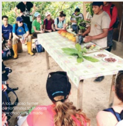
A local cacao farmer demonstrates to students how chocolate is made